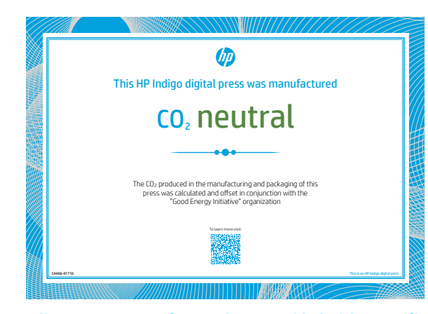
HP Indigo presses manufactured are provided with a certificate.