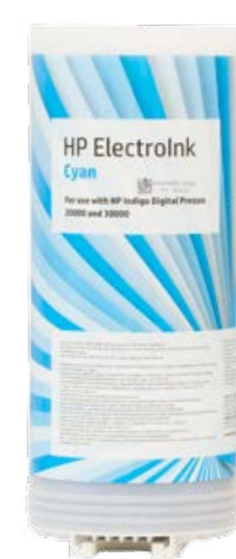
New generation ink tube made from recycled plastic